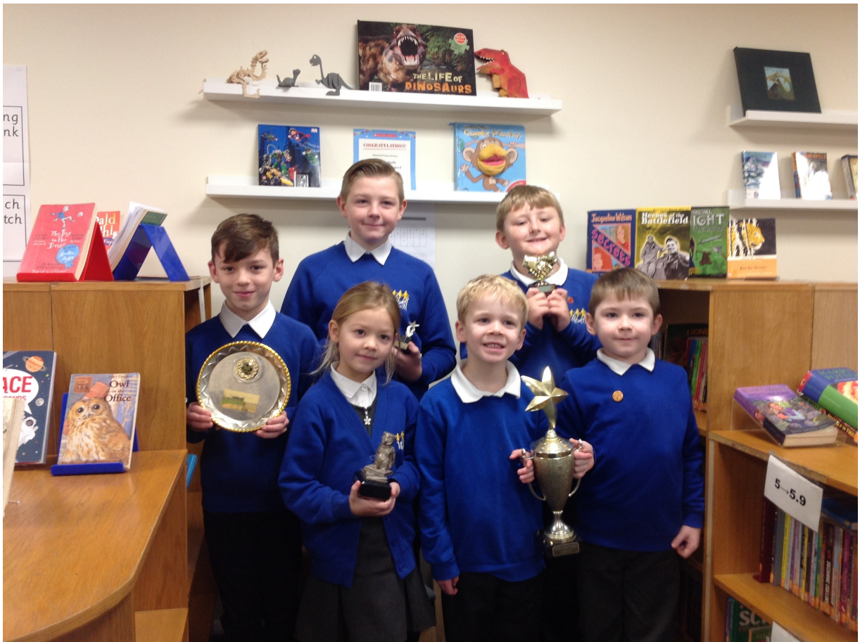
Weekly cup winners