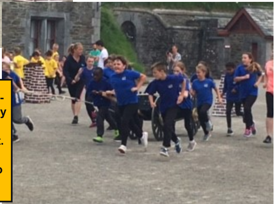
The Widewell Wolves had a fantastic day at Crownhill Fort on Sunday 3 rd June. They won all 6 of their runs and showed great team spirit. Roll on Armed Forces Day! Many thanks to the parents who came to support.