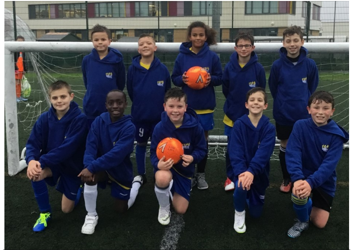
Year 5 and 6 Football