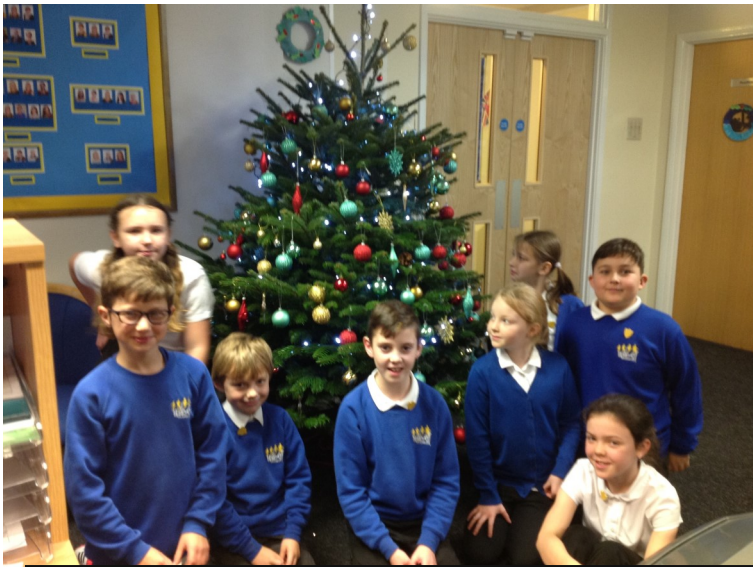
Decorating the Christmas Tree