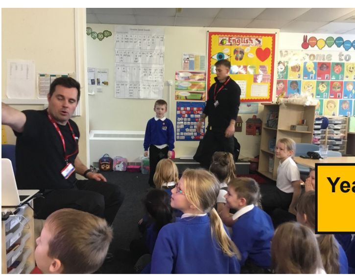
Year 2 visit from the Fire Station