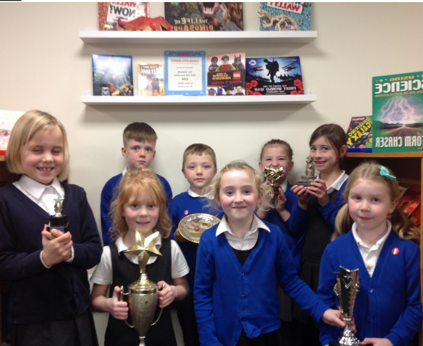
Weekly cup winners